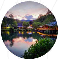
Brevard Music Center