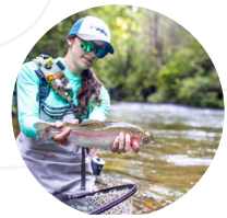
Pisgah Center for Wildlife Education